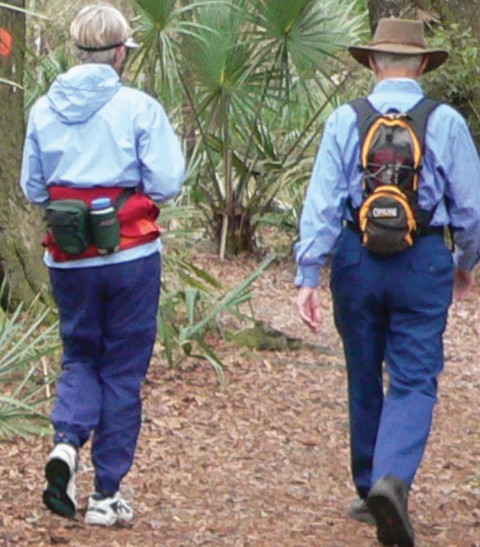
Crossing Central Florida from the Gulf of Mexico to the St. Johns River